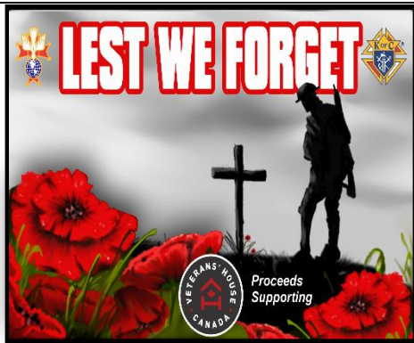
Poppies for Veterans

2025/2026 Sunday Missals are now available at the back of the Church. They are only $6.00 this year! We will begin using the new missals on December 1, which is the first Sunday of the new liturgical Year.